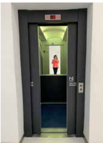
LIFT height: 200 cm width: 78 cm