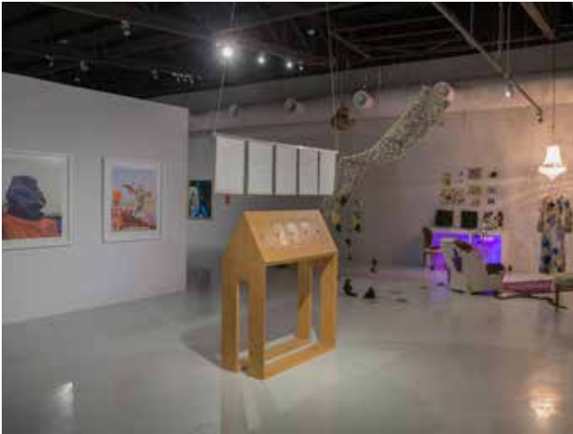
Tashweesh, March 2019