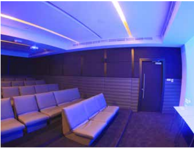
Maraya Art Centre

(We can accommodate 2 options: 30 pax Screening Room on the 1st floor of Maraya Art Centre or 300 pax at Al Qasba Theatre)