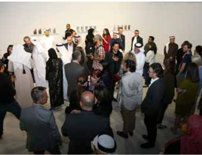
Tashweesh, March 2019