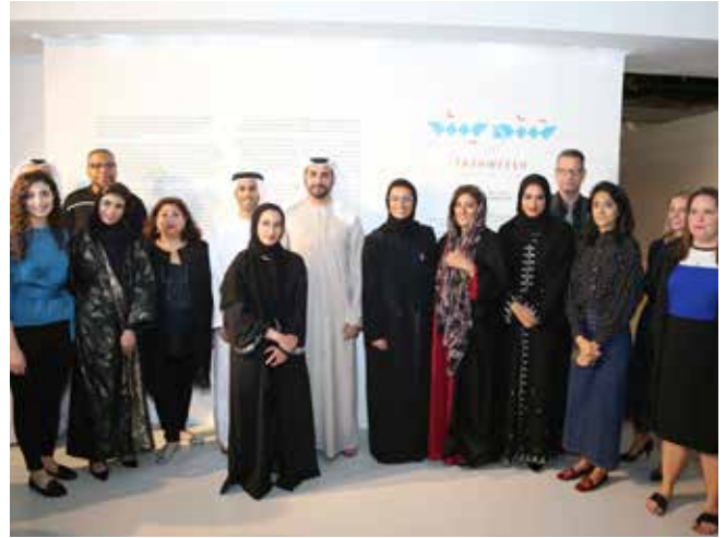
Tashweesh, March 2019