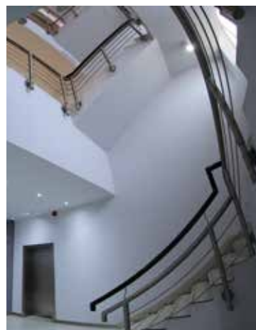
STAIRCASE maximum dimensions width: 130 cm