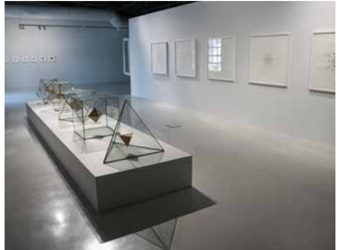
The Silence between Us, December 2018