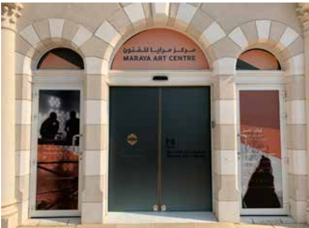
MAIN ENTRANCE height: 214 cm width: 176 cm

(any over dimensional works, difficult to transport? Or dimensions that exceed Maraya Art Centre's elevator / main entrance / stair case dimensions)