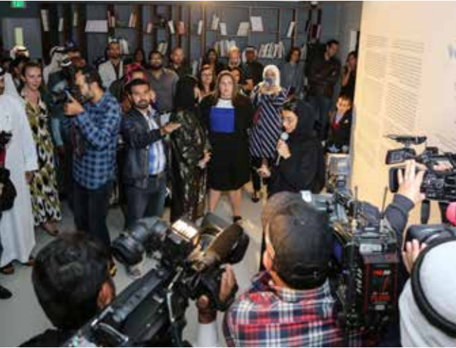
Tashweesh, March 2019