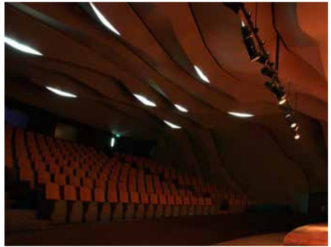
Al Qasba Theatre