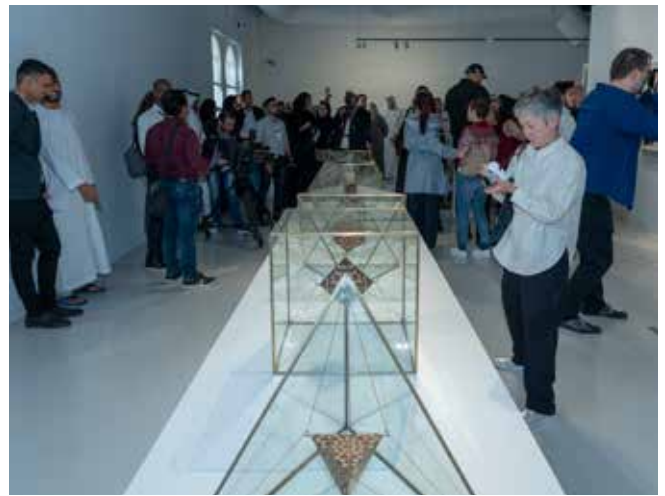
The Silence between Us, December 2018